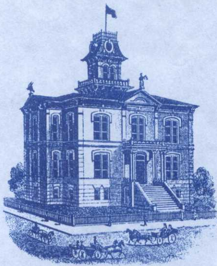
Historical Courthouse Built 1887